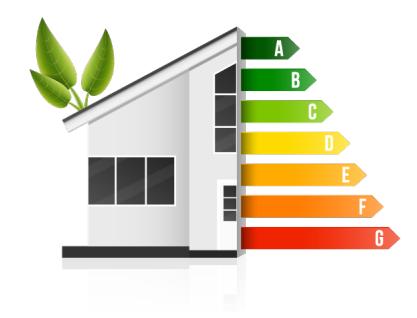
Energy certificate: Pending